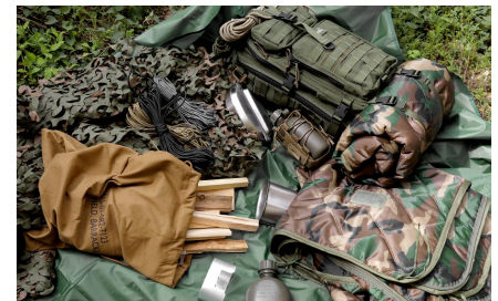
SURVIVAL AND OUTDOOR EQUIPMENT