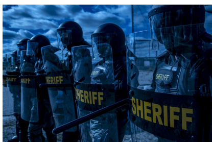
BODY ARMOUR AND PROTECTION