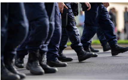
CLOTHING AND FOOTWEAR