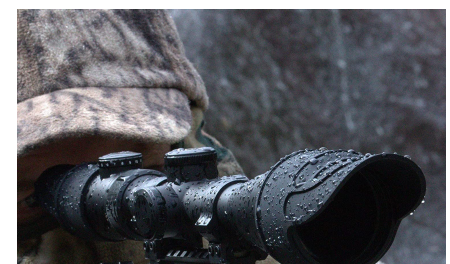
OPTICS AND FIREARM ACCESSORIES