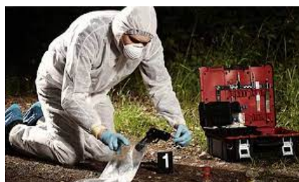
FORENSICS AND CIS EQUIPMENT